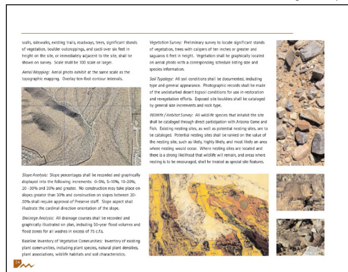
Environmental Site Analysis